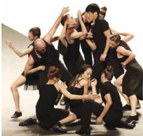
Batsheva Dance Company, Venezuela, 4/12