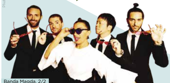
Banda Magda, 2/2