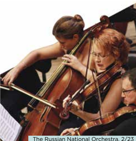
The Russian National Orchestra, 2/23