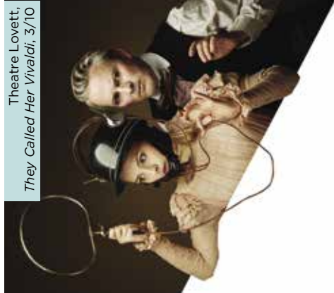
Theatre Lovett, They Called Her Vivaldi , 3/10