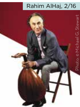
Rahim AlHaj, 2/16