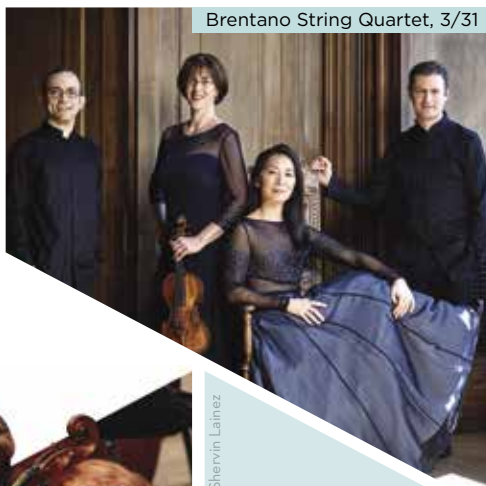
Brentano String Quartet, 3/31