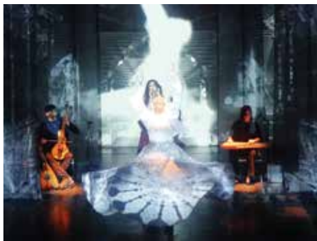
Niyaz, The Fourth Light Project