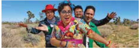
La Santa Cecilia