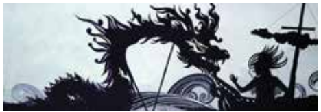
Feathers of Fire