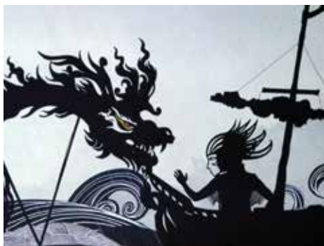
Feathers of Fire: A Persian Epic