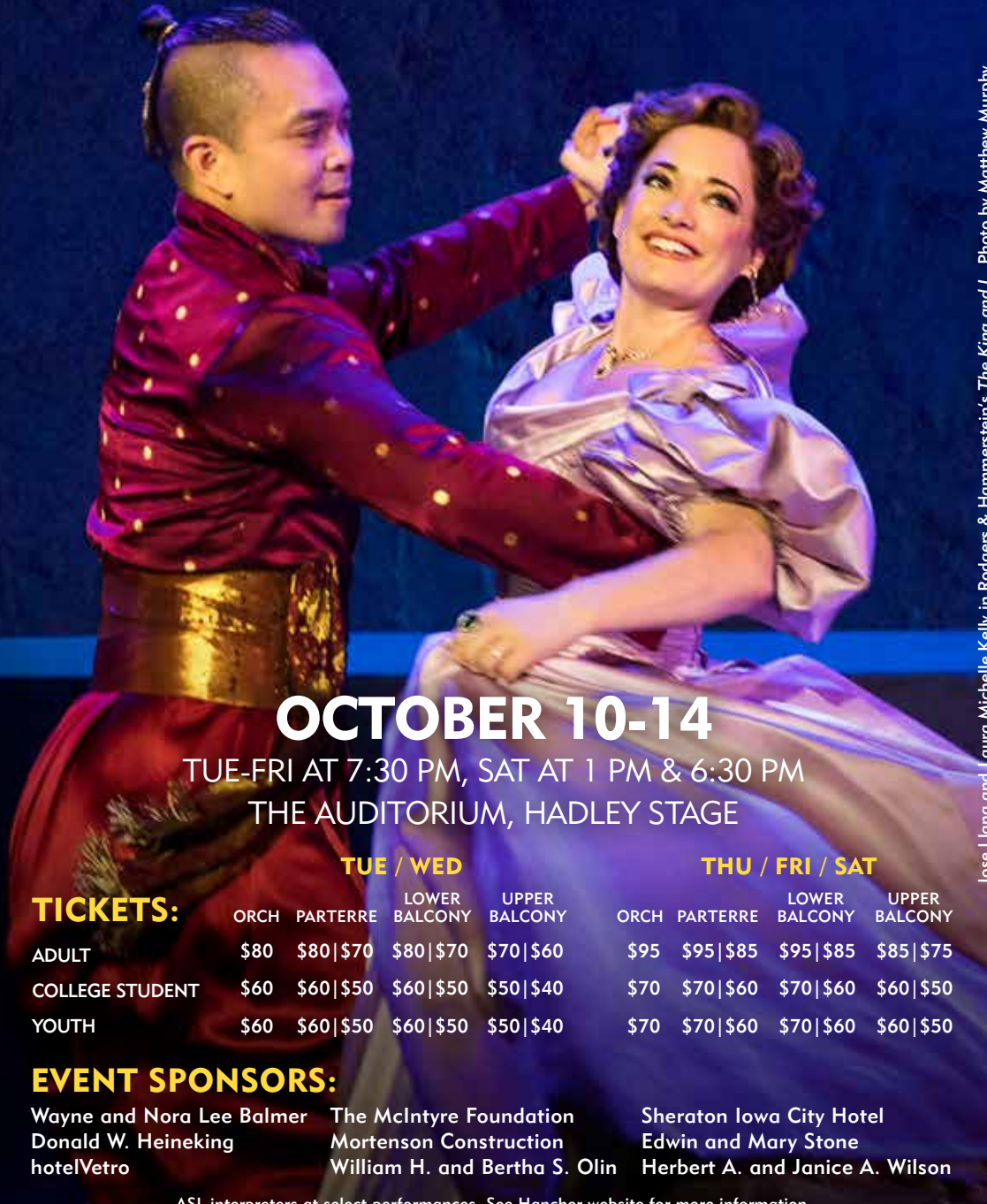
Jose Llana and Laura Michelle Kelly in Rodgers & Hammerstein's The King and I.