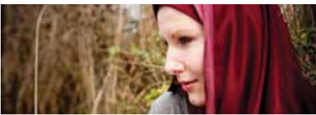
G. Willow Wilson