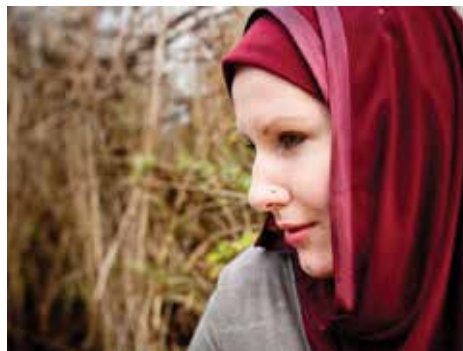
G. Willow Wilson