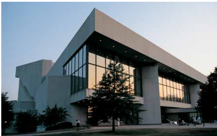
Hancher Auditorium in the 1980s

I began attending performances at Hancher as a college student. The building with its concrete brutalist nature may have seemed severe on the outside, but what happened on stage: sensational! I saw world-class dance companies at Hancher: Mark Morris, Pilobolus, Mummenschanz, and the UI's own dance majors. Rudolf Nureyev had danced on its stage! Joan Armatrading got everyone up out of their seats dancing. I can say I danced at Hancher, too.