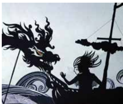
Feathers of Fire: A Persian Epic