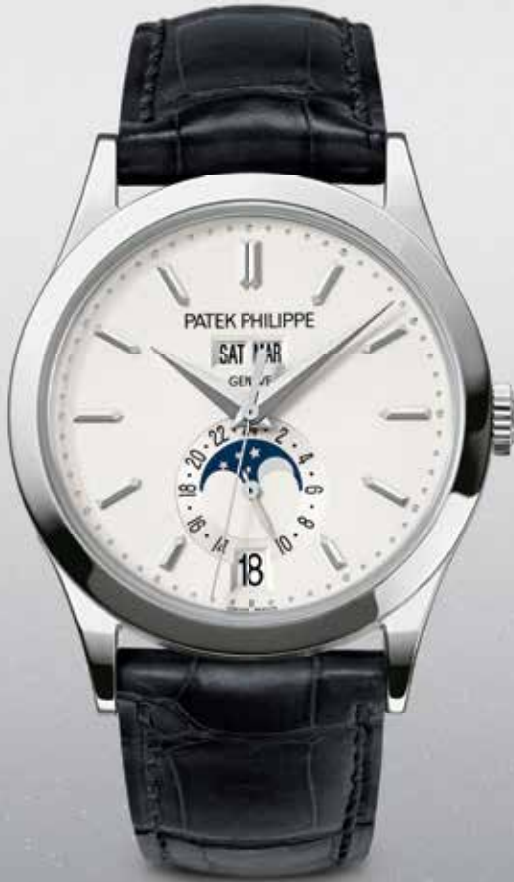
Annual Calendar Ref. 5396G

You never actually own a Patek Philippe. You merely take care of it for the next generation.