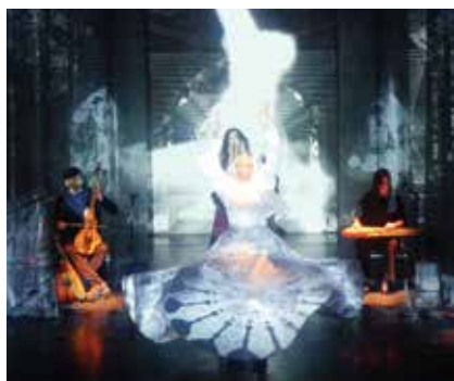
Niyaz, The Fourth Light Project