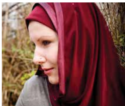
G. Willow Wilson