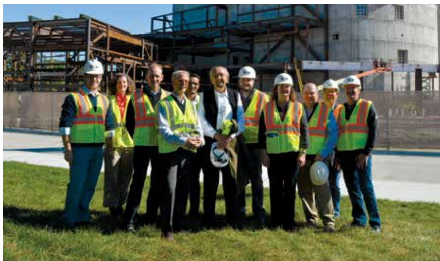
Cesar Pelli (center) at the Hancher site on October 8, 2014.