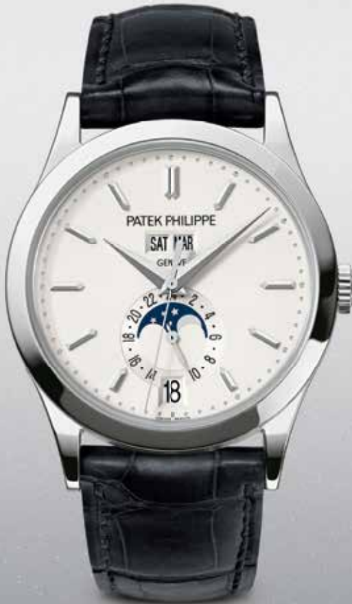
Annual Calendar Ref. 5396G

You never actually own a Patek Philippe. You merely take care of it for the next generation.