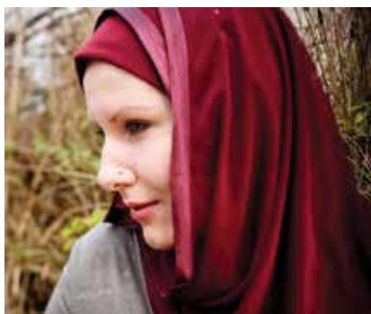
G. Willow Wilson