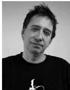
John Zorn

The music of John Zorn defies categorization—deliberately so. For a man of such wide-ranging eclectic interests and tastes, any label becomes a straitjacket, restrictive and limiting. Over the course of his long career, the New-York-based saxophonist—composer—conductor—band leader—arranger—producer has created music that spans a broad range of genres, including jazz, metal, avant-garde, punk, classical, and world sounds. “Just as some people have a command of several languages, I can express myself fluently in several musical genres,” he says.