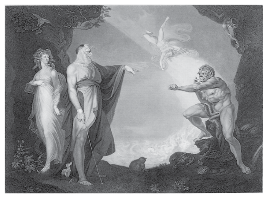
The Enchanted Island Before the Cell of Prospero - Prospero, Miranda, Caliban and Ariel (Shakespeare, The Tempest, Act 1, Scene 2), from the American edition of Boydell's Illustrations of the Dramatic Works of Shakespeare (1797).

Western 12-note system (for fun). As Prospero says: 'But this rough magic I here abjure, and when I have required some heavenly music, which even now I do, to work mine end upon their senses that this airy charm is for, I'll break my staff, bury it certain fathoms in the earth, and deeper than did ever plummet sound I'll drown my book.' (Solemn music)."