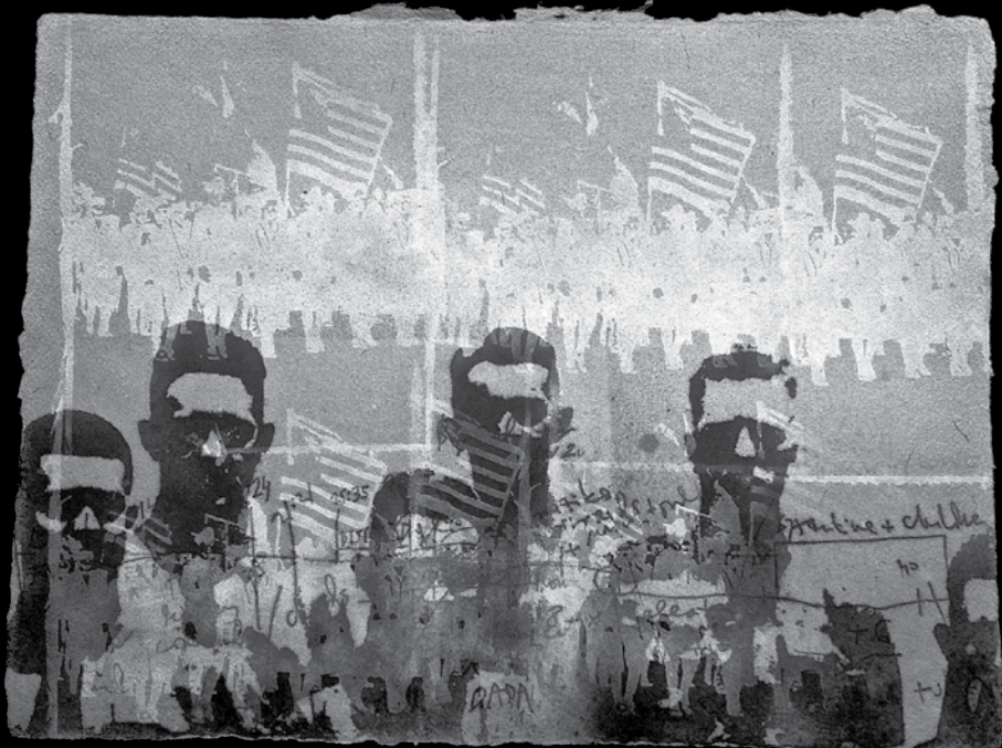
Untitled Pulp Print on Combat Paper by Drew Cameron