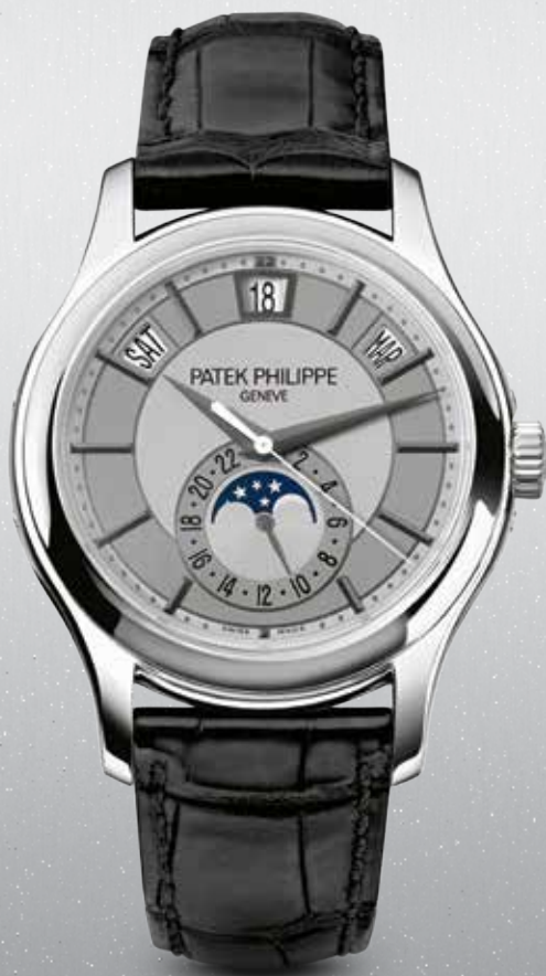
Annual Calendar Ref. 5205G

You never actually own a Patek Philippe. You merely take care of it for the next generation.