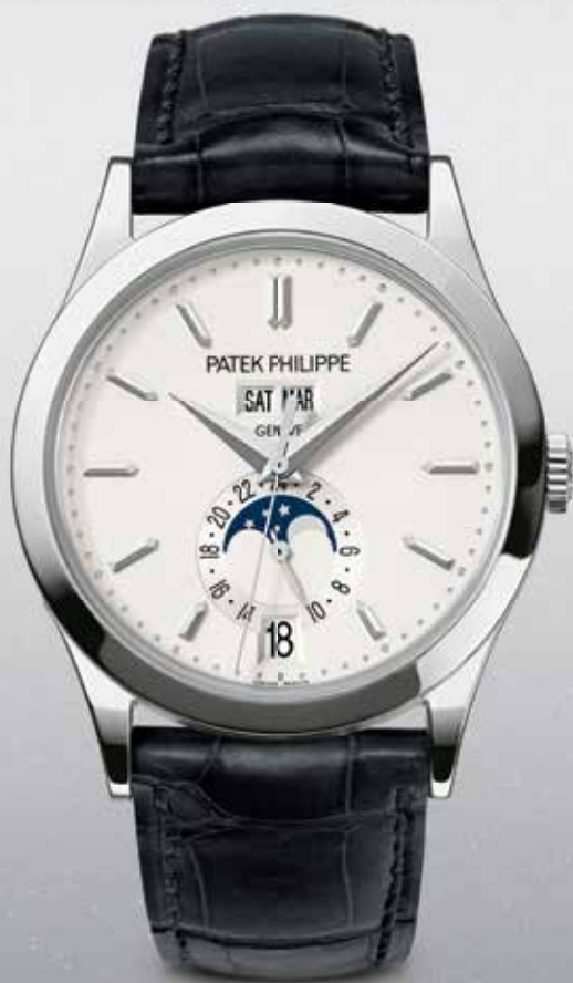
Annual Calendar Ref. 5396G

You never actually own a Patek Philippe. You merely take care of it for the next generation.