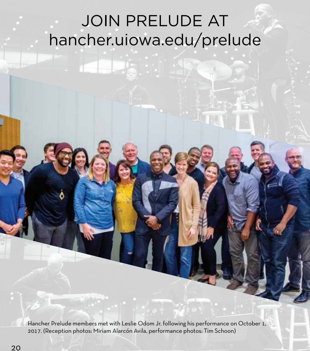
Hancher Prelude members met with Leslie Odom Jr. following his performance on October 1, 2017.

JOIN PRELUDE AT hancher.uiowa.edu/prelude