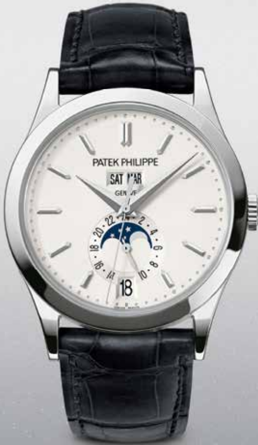
Annual Calendar Ref. 5396G

You never actually own a Patek Philippe. You merely take care of it for the next generation.