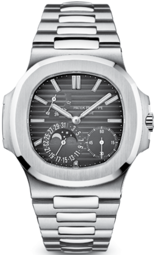
Nautilus Ref. 5712/1A

You never actually own a Patek Philippe. You merely take care of it for the next generation.