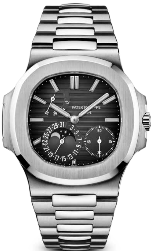
Nautilus Ref. 5712/1A