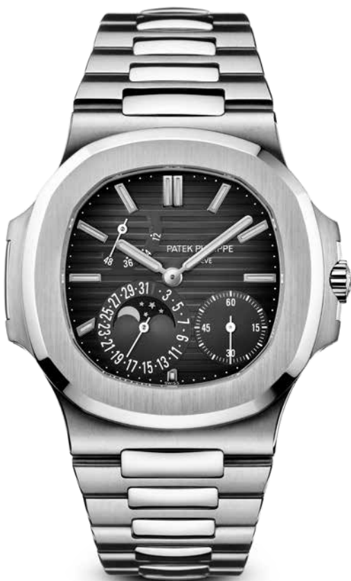
Nautilus Ref. 5712/1A

You never actually own a Patek Philippe. You merely take care of it for the next generation.