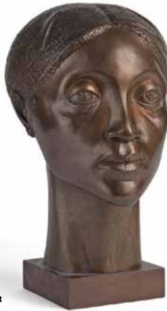
Glory, 1961. Museum purchase with support from the Joyce P. Summerwill Art Fund, 2022.1. Elizabeth Catlett