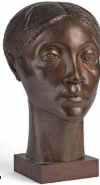
Glory, 1961. Museum purchase with support from the Joyce P. Summerwill Art Fund, 2022.1. Elizabeth Catlett ©2022 Catlett Mora Family Trust/Licensed by VAGA at Artist Rights Society (ARS), NY.