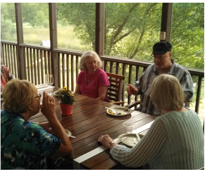
Guild members enjoy visiting on the screened porch.