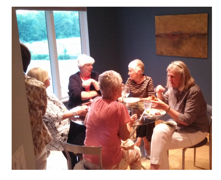
Conversation, delicious food and new ideas were shared by Guild members during the evening.