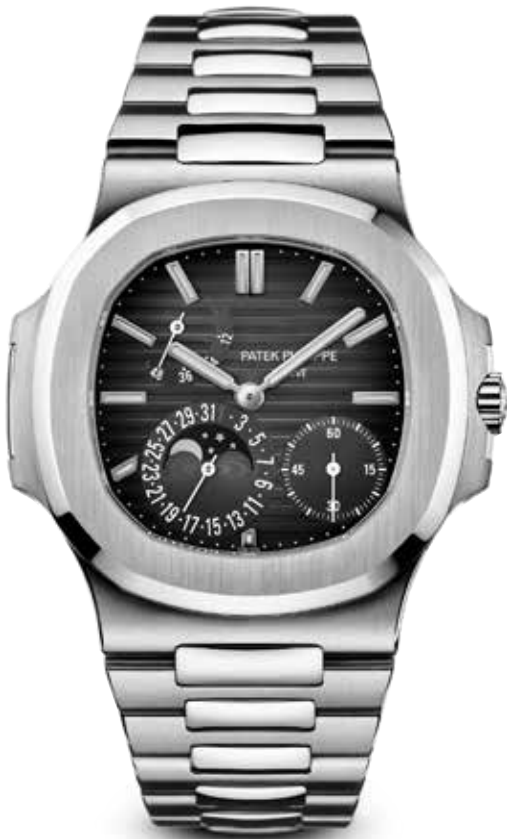
Nautilus Ref. 5712/1A