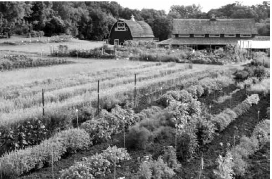
Seed Savers Exchange's Heritage Farm in Decorah, Iowa

As I traveled west across the state I found myself interviewing people connected to the meat-packing industry. In these towns I found more diversity