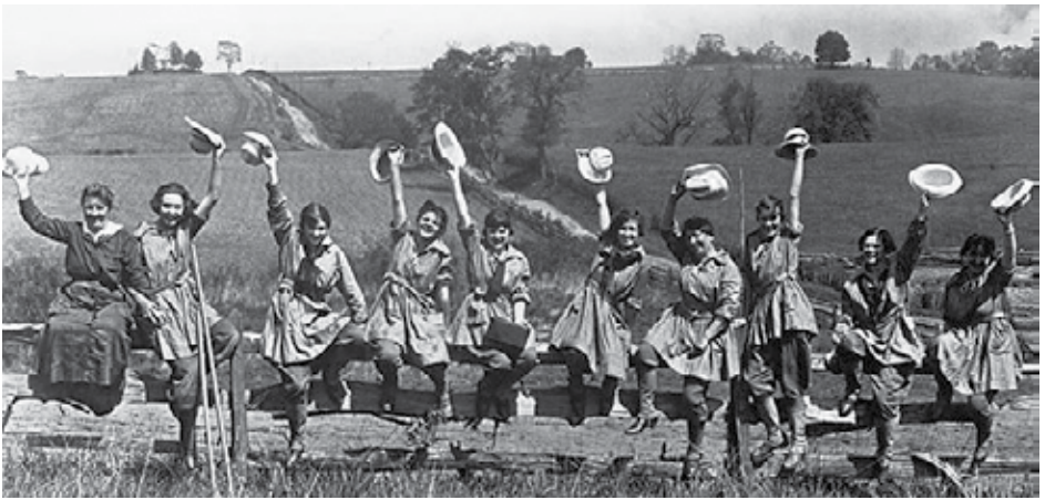
Above: Members of the Women's Land Army Right: Women's Land Army Recruiting Poster

than on most of the streets of Iowa City or Des Moines. I also spoke with a woman from Altoona who told me a story of her grandmother belonging to the Women's Land Army south of Council Bluffs. She talked about the first canning locale in her hometown and how it was run by the women in this town while the men were at war. She spoke about the pride it sparked in her grandmother and how she passed that on to her granddaughters (along with a killer chicken soup recipe).