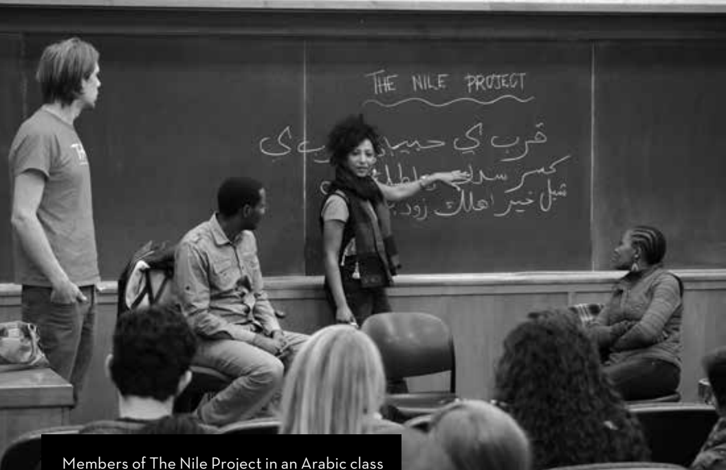
Members of The Nile Project in an Arabic class at the University of Iowa.

center was packed with people of all ages. After leaving the center, The Nile Project musicians noted that this was the boost in energy they needed after a long couple months of touring. “It felt like coming home” one musician said. This was a highlight of the week and made a significant impression on the Hancher staff.