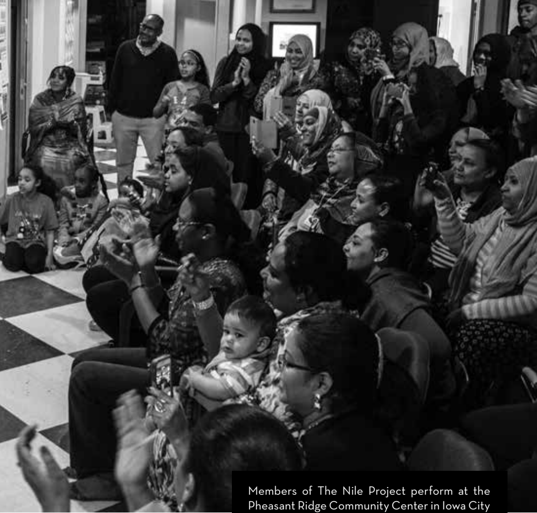
Members of The Nile Project perform at the Pheasant Ridge Community Center in Iowa City on March 9, 2015.

dialogue between artists from around the world and people in our community. This group was a great example of this, highlighting traditions from many countries in Africa, while also exploring their contemporary take on music. The band interacted with a wide range of ages during their time in town, performing for elementary students, spending time in a high school, and encouraging college students to sing and dance in class.