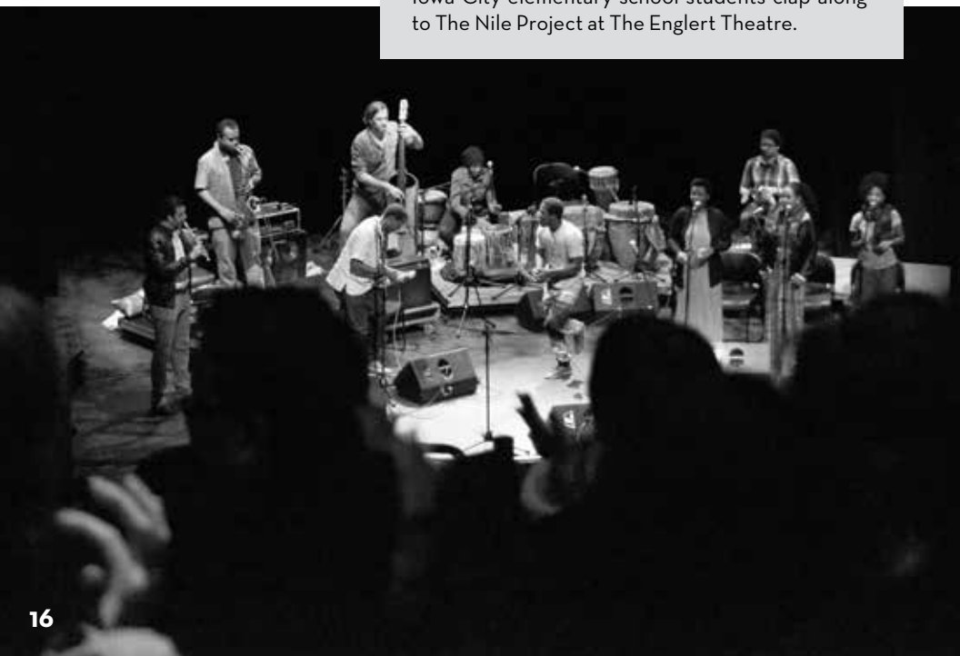
Iowa City elementary school students clap along to The Nile Project at The Englert Theatre.

The group also worked with UI students studying Arabic and Swahili. The students were really engaged in the discussion and were excited to learn more about the music and culture from a number of countries. The musicians even got the college students to sing! The group also played a sold-out school show for Iowa City elementary students. The Englert Theatre was full of students dancing, clapping, and laughing to the music. The students were able to ask the musicians questions during the school show, learning more about the instruments and regions of Africa.